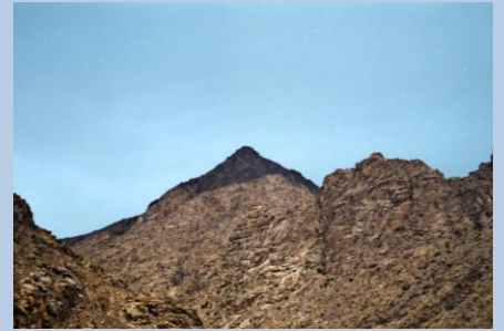
The blackened peak of the real Mount Sinai located in Saudi Arabia, scorched by the presence of God.